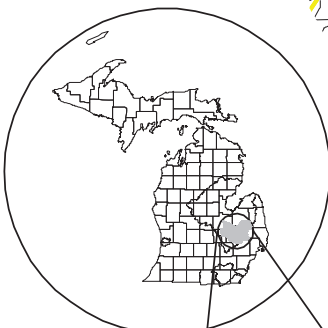
AREA MAP NOT TO SCALE